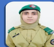
Cadet Tuba (Secured 990 marks out of 1100) (Achieved A1 Grade)